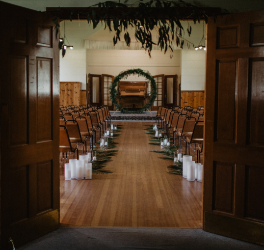
Looking in from Lobby