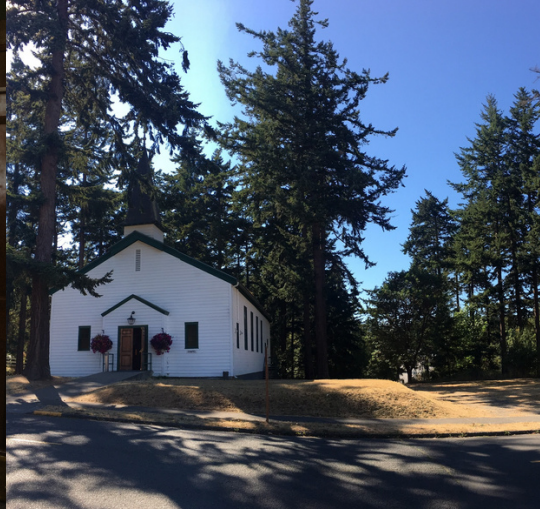
Exterior & Loading Area